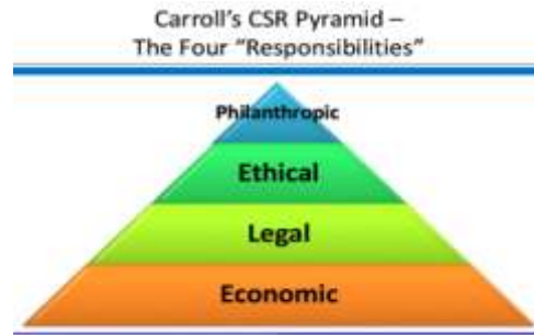
Fig.1 Carroll's pyramid

(Source: Carroll, A. B. (1983). Corporate social responsibility: Will industry respond to cut-backs in social program funding? Vital Speeches of the Day , 49, p. 604-608.)